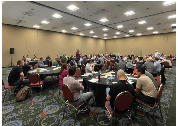
EBBA event where attendees discussed bringing more efficient windows to market